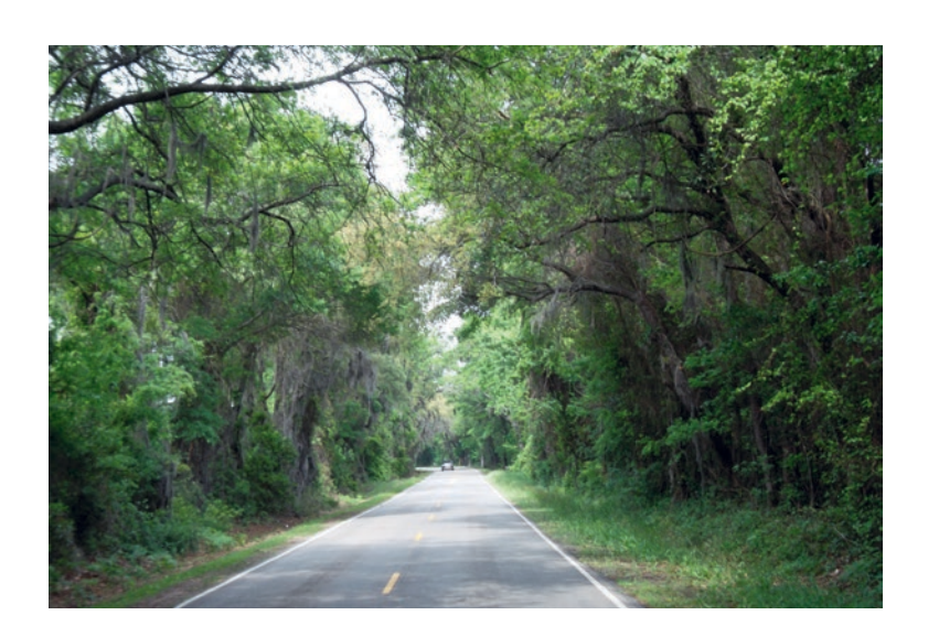
5 Northbound road on St. Helena Island, South Carolina, April 29, 2013.

side of the new chapel by Saturday, February 11. They drove full logs into the ground for the ends. Split logs set in the same way made the sides. A ridge pole and rafters completed the frame. Finally, they stretched and fastened down the immense single sheet of canvas, sixty feet long by forty feet wide.