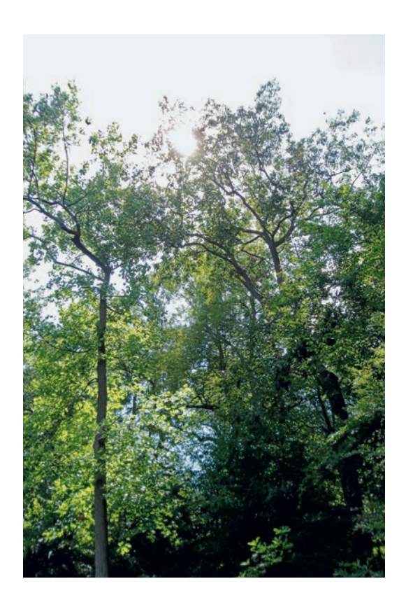
7 Looking up from the shore of the James River some miles southeast of Richmond, Virginia, July 29, 2011.