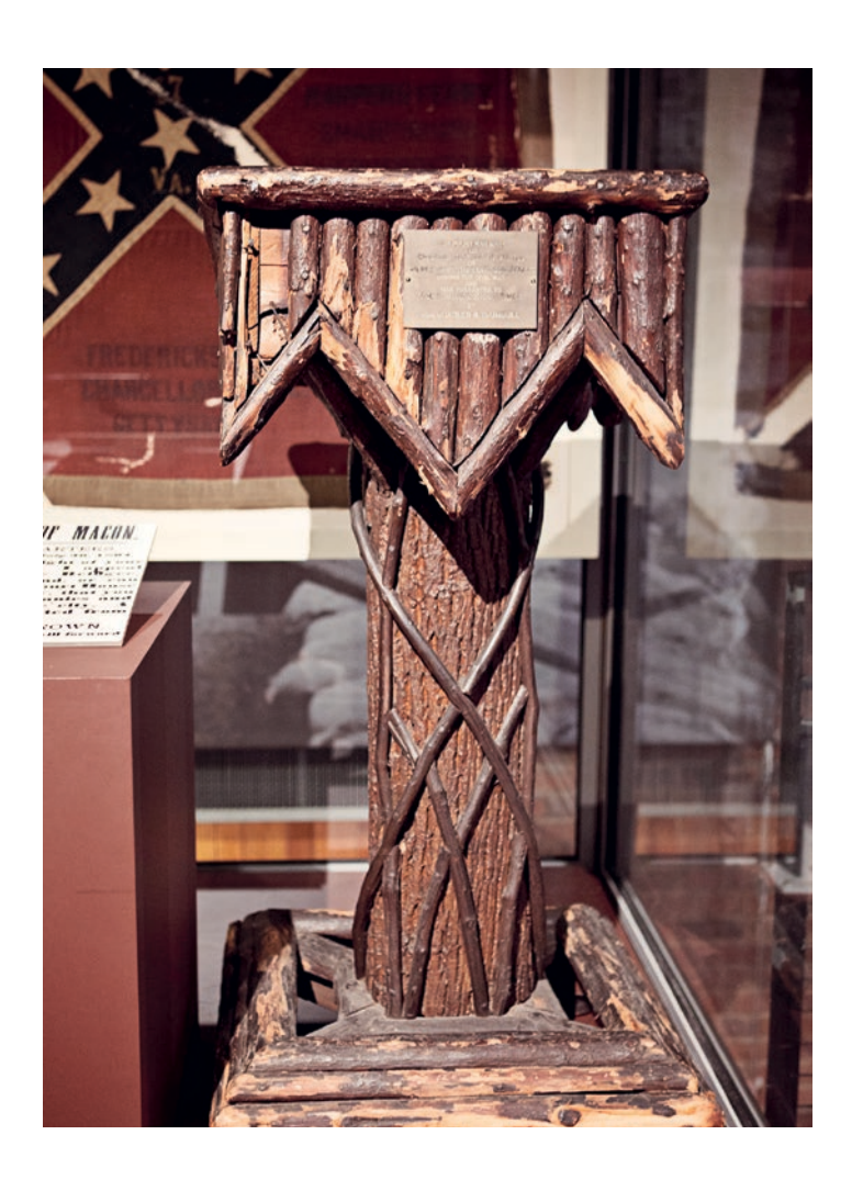
2 Pulpit, with glass display case opened, August 22, 2014.

Not knowing whether the pulpit still existed, I wandered unawares by the lighted displays and prop walls of the Civil War