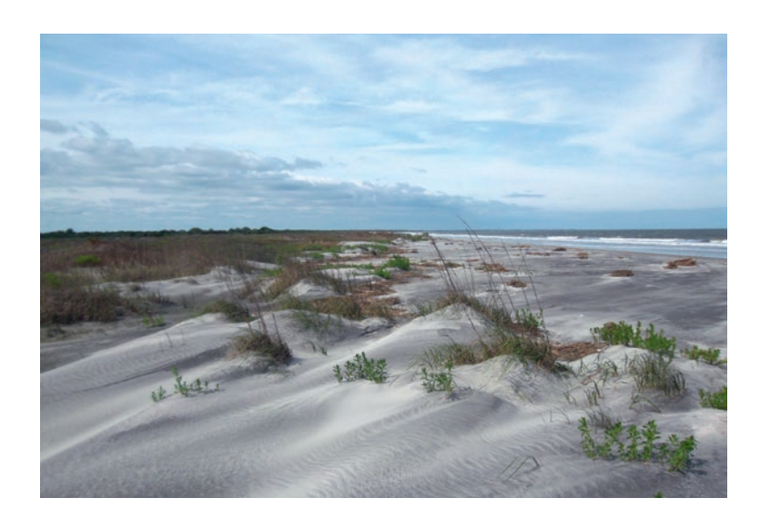
Shore of Morris Island, South Carolina, May 1, 2013.

sand hills of Morris Island, just outside Charleston. The Henrys cradled themselves in their folds, thrown up by the ocean in a century's succession of storms (fig. 6). When they stood to watch the nighttime battle raging before them on land and sea, they could only see the "swift tongues of flame piercing deep into the darkness and bringing out in momentary distinctness," and "with vivid brilliance," the upward rolling smoke, the water, and the "immense hull [of the ship] from which they sprung." From their perspective, the scene was one of absolute magnificence to Camp.