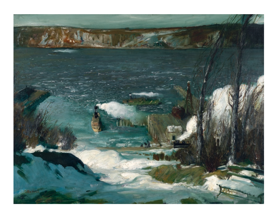
2 George Bellows, North River, 1908. Oil on canvas, 32 % × 43 in. (83.5 × 109.2 cm). Pennsylvania Academy of the Fine Arts, Philadelphia. Joseph E. Temple Fund, 1909.2.

These mysterious bodies of water are active agents in Bellows's account of the city. On one level, they are utilitarian economic highways, but their darkness and frigidity become in these paintings figures for enigmatic aspects of urban experience, exceeding and qualifying their workaday functions. They become presences that imply other registers, other meanings, and other existences beyond the commonplace human world, which bustles and hums along, seemingly without touching them. In Snow Dumpers as much as in The Lone Tenement (1909) (fig. 4), the swelling, mobile river is a protagonist at least equal to the human actors. In itself, this is not