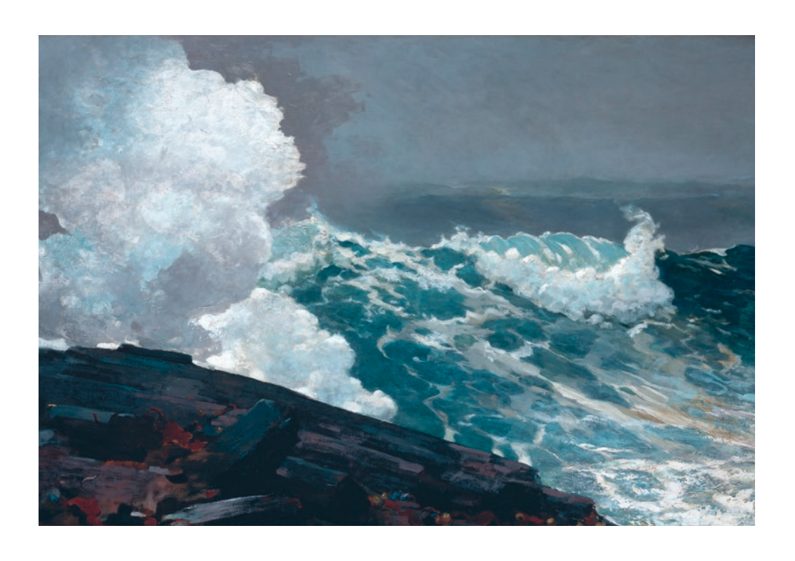
9 Winslow Homer, Northeaster, 1895–1901. Oil on canvas, 34 ½ × 50 in. (87.6 × 127 cm). The Metropolitan Museum of Art, New York. Gift of George A. Hearn, 1910, 10.64.5.

At this point it may be useful to contrast Bellows with his principal predecessor among the painters of sea and shore in Monhegan Island. Winslow Homer's evocations of the sea show an intermixture of the human and the nonhuman comparable to Bellows's. Ranging from Breezing Up (A Fair Wind) (1873–1876) (fig. 8) to Northeaster (1895–1901)