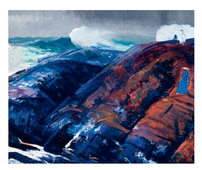
10 George Bellows, Summer Surf, 1914. Oil on panel, 18 × 22 ½ in. (45.7 × 56.2 cm). Delaware Art Museum, Wilmington. Gift of the Friends of Art, 1961, 1961-12.

an insertion of the human subject in the natural in ways that entertain that subject's inferiority or subordination to the world rather than asserting it as triumph.