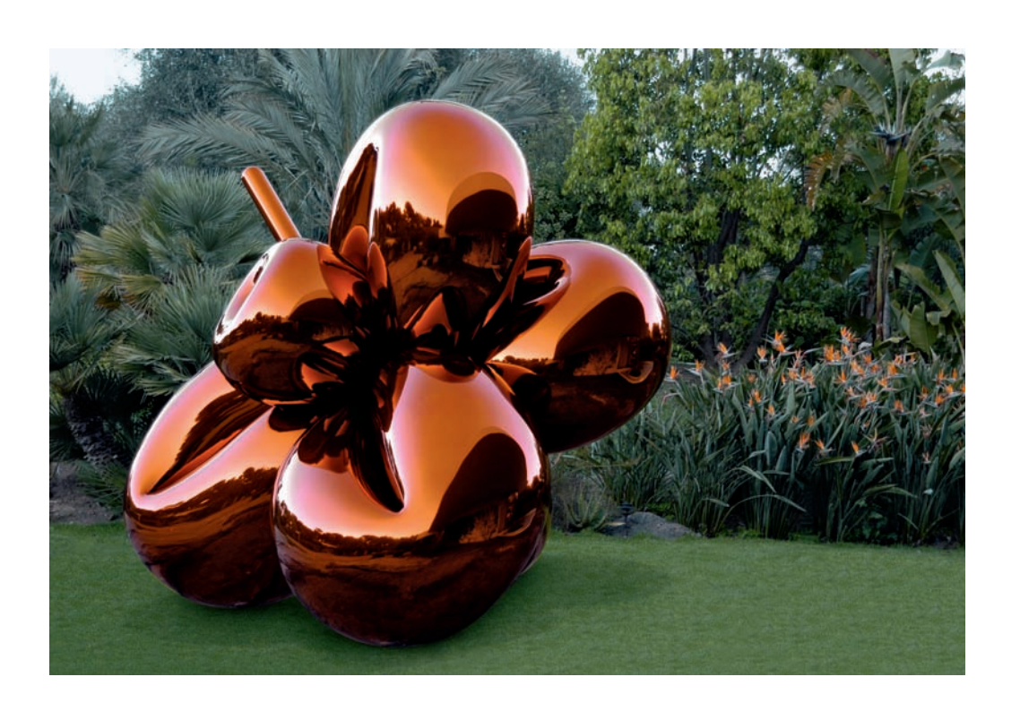
7 Jeff Koons, Balloon Flower (Orange), 1995–2000. Mirrorpolished stainless steel with transparent color coating, 133 <sup>3</sup>/<sub>4</sub> × 112 <sup>1</sup>/<sub>4</sub> × 102 <sup>1</sup>/<sub>4</sub> in. (340 × 285 × 260 cm).

The rise of surveillance, of course, refracts this history to a substantial degree. Over the course of the twentieth century, the gaze took on an institutional cast. Just as corporations came to be deemed persons for many legal purposes, the power of looking was increasingly accorded to institutional entities. The sense of looked-at-ness thus spread from the scenario of the individual within a social group to the tracking of the individual within geopolitical spaces. The issue of belonging largely gave way to the issue of social control, and less anxiety was attached to being a stain and more to being a profile of data or a target of violence. With thermal cameras and other devices, the catching of the individual in a cone of detection extended beyond the visible. By now the subject has become a confusing mix of individuated bodily presence, unit of continually reassembled data, and interactive network node. Much contemporary art and criticism has grappled with these new conditions.