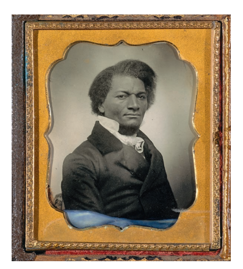
3 Frederick Douglass, ca. 1855. Daguerreotype, 2 ¾ × 2 ¾ 6 in. (7 × 5.6 cm). The Metropolitan Museum of Art, New York. The Rubel Collection, Partial and Promised Gift of William Rubel, 2001, 2001.756.

daguerreotype caught glimpses of his own face mingling with that of the depicted. As Dinius notes, Douglass found in the daguerreotype not only an affordable means of obtaining self-portraits but also a logic of reciprocity and inversion that seemed both to display the structure of racism and to provide a means for its mitigation.