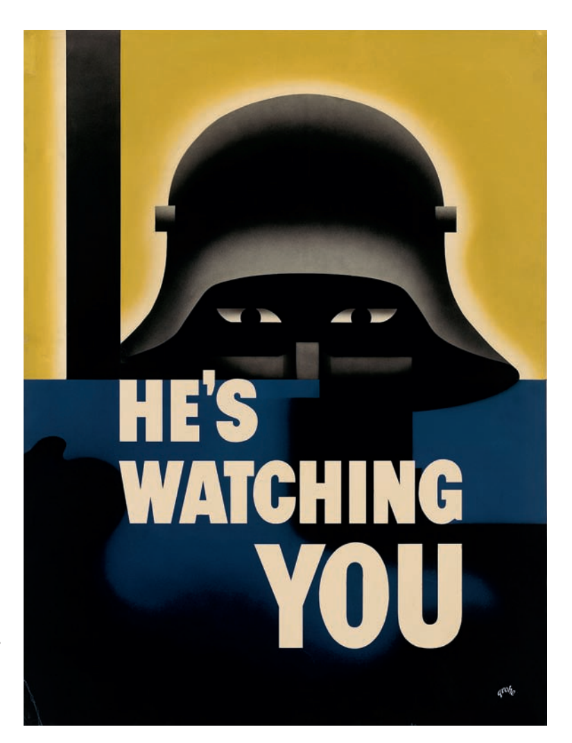
4 Glenn Ernest Grohe, He's Watching You, ca. 1942. Poster, 12 ½ × 16 ½ in. (30.75 × 40.75 cm). National Archives and Record Administration, Still Pictures Branch, College Park, Maryland, ARC identifier 7387549, local identifier 208-AOP-119.

the possibility that this historical function came into view because photography had more or less nullified it. Before photography, the access of the elite to fantasies of remaining unviewed while viewing seemed a normal condition. The historical turn that photography delivered surfaces in the language of twentieth-century theorizations of the subject. Whereas Lacan discusses being photo-graphed from all sides, Sartre describes the "pure interiority" of the Other as it appears to the subject as "something comparable to a sensitized plate in the closed compartment of a camera." <sup>52</sup> For both writers, photography had become essential to understanding subjectivity.