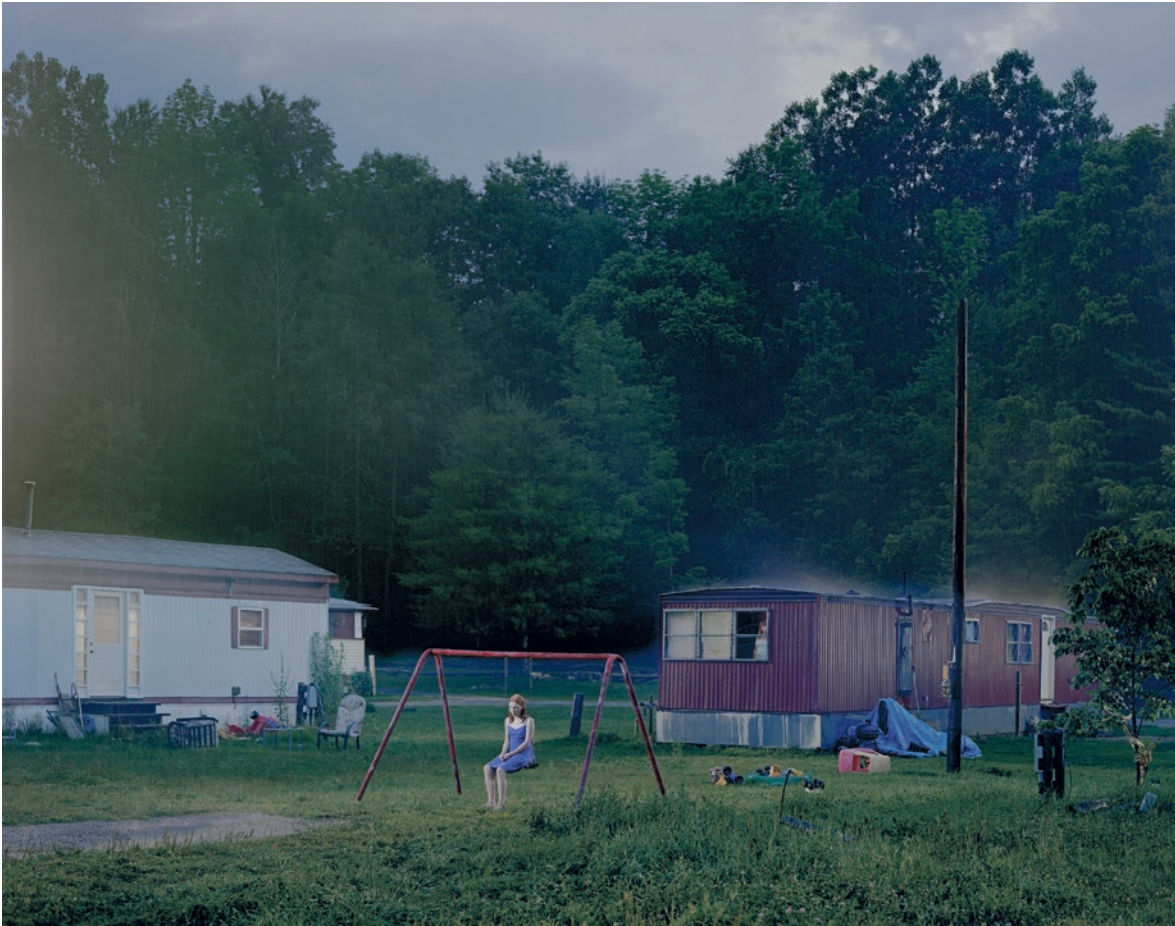
10 Gregory Crewdson, Untitled , 2006–2008. Photograph.

surmounted by summer trees, twilight emptiness of picket fences and shrubs, existentially isolated figures—these all unite the work of Crewdson and Hopper. In a way that speaks to his artistic coming of age in the 1980s, Crewdson’s quotations of Hopper read as a knowing self-referentiality—a pleasure in artifice—so characteristic of those years. The equally resonant comparison of Crewdson’s work to that of the director David Lynch—in particular to Blue Velvet , Lynch’s stylized 1986 film about an American small town—also points up the resolute contrivance of his pictures. Yet behind these references, and uniting Crewdson, Hopper, and Lynch, is an absolutely un-ironic sense of cornering a feeling actually out there—a quality in the world, a quality metaphysical and social, to be found in an American location. 6 That quality is a melancholy isolation, as if the art in each case were taken as an occasion, a gathering point, for that isolation to focus