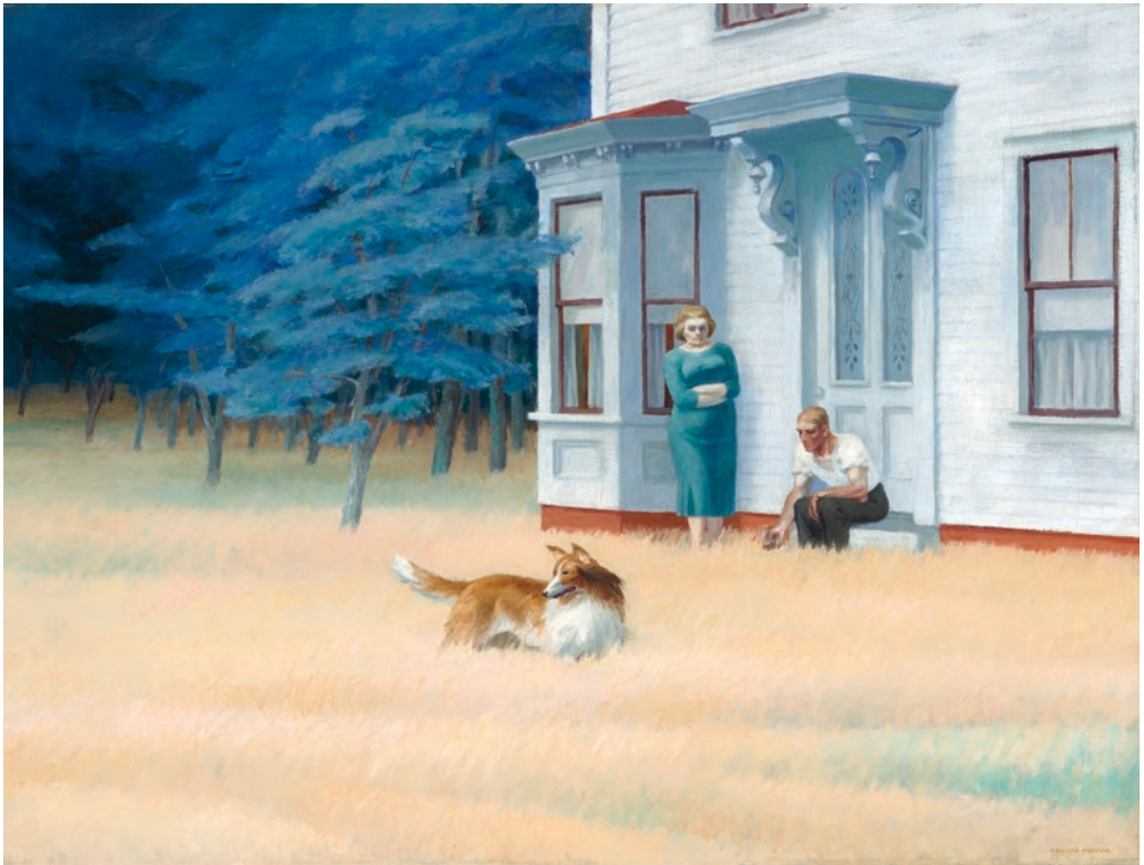
11 Edward Hopper, Cape Cod Evening , 1939. Oil on canvas, 30 x 40 in. (76.2 x 101.6 cm). National Gallery of Art, Washington, DC. John Hay Whitney Collection, 1982.76.6.