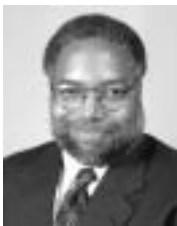
Lonnie G. Bunch

I am struck by the pain, power, and memories that radiate from Slaves by Thomas Hart Benton. As a historian, I am always concerned about America's lack of historical literacy, especially as it relates to slavery. In many ways, slavery is the last great unmentionable in popular discourse. There are few places outside of a college classroom where Americans—black and white—can confront the legacy and the contemporary meaning of the inhumanity that the enslaved endured. While Benton captures the brutality of the “peculiar institution,” Slaves is less successful in depicting the manner in which African Americans struggled to exercise greater autonomy and to gain their freedom. Yet I also can marvel at the strength, the cultural creativity, the spirituality, and the ability to persevere that is the legacy of those held in bondage. What I like most about Benton's Slaves is that it helps us to remember a time that many want to forget. And there is nothing more noble than to honor our ancestors by remembering.