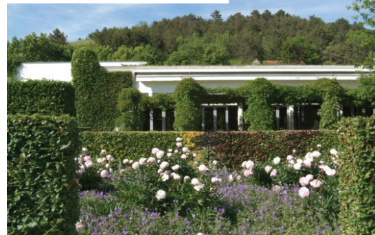
Musée des Impressionnismes Giverny

The house where Monet lived from 1883 to 1926 contains the artist's collection of Japanese engravings. Facing the artist's house and studio are the Norman flower and water gardens that inspired so much of his work.