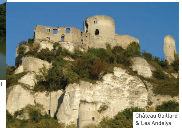
Château Gaillard & Les Andelys

Villarceaux includes two châteaux and a succession of gardens and out-buildings dating from the Middle Ages to the late nineteenth century.