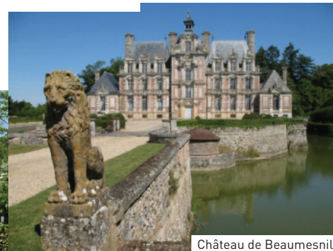
Château de Beaumesnil