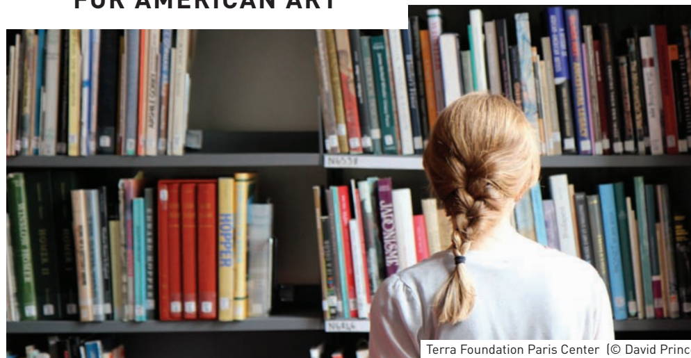
Terra Foundation Paris Center