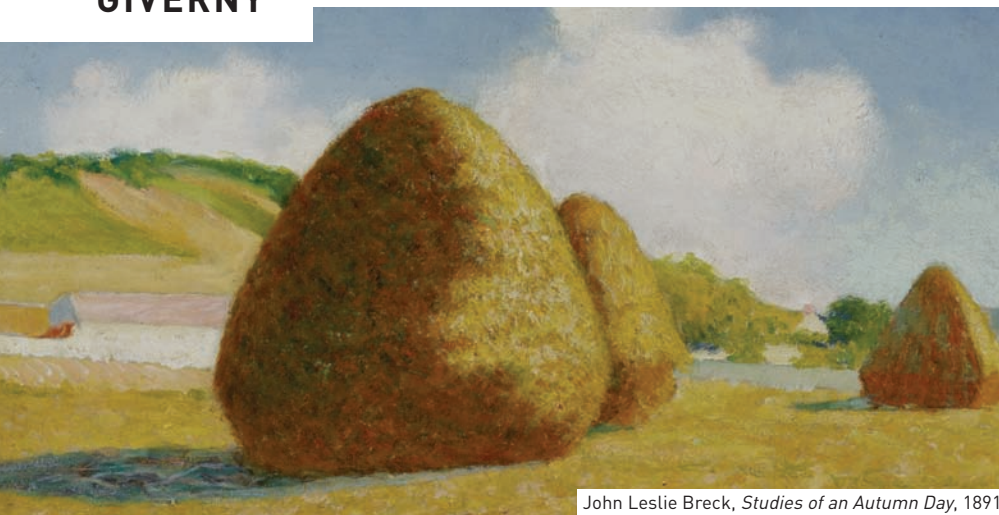
John Leslie Breck, Studies of an Autumn Day , 1891

Between 1885 and 1915, the picturesque village of Giverny welcomed hundreds of artists who were drawn by the prospect of painting en plein air, the presence of Claude Monet, and the beauty of the region. Many stayed for long periods, painted outdoors, purchased homes and studios, and ultimately transformed the village into an international artists' colony.