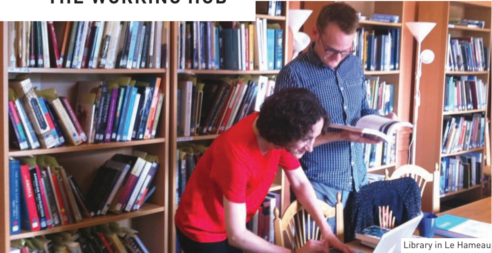
Library in Le Hameau

This farmhouse was originally home to several artists from the Giverny colony (see cover image). Between 1889 and 1909, American artist Lilla Cabot Perry spent numerous summers with her family in Le Hameau (“The Hamlet”). She was eventually befriended by her neighbor, the great impressionist painter Claude Monet, who attended her musical soirées, joined her for walks in the gardens, and advised her on painting technique.