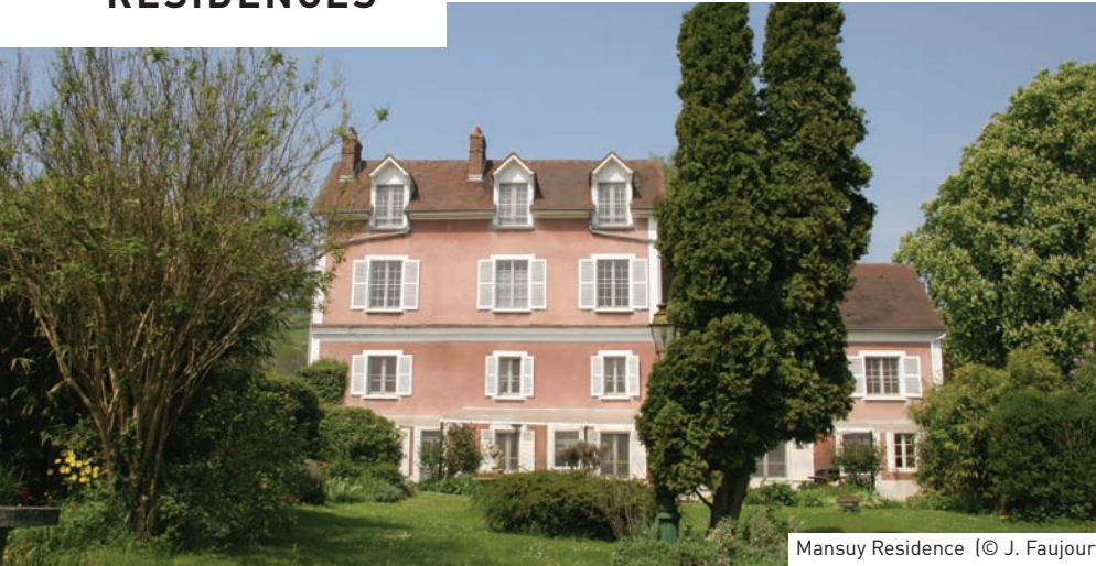
Mansuy Residence

The Terra Foundation's four residential properties are nestled in the heart of Giverny. Surrounded by landscaped gardens, the properties offer an environment conducive to study, creativity, discussion, and teamwork.