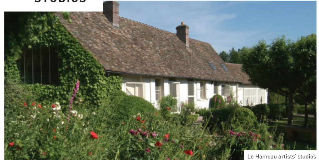
Le Hameau artists' studios

Six studios are available to the artists in residence, four in Le Hameau and two adjacent to the Champrenault and Goupil residences. Artists are responsible for acquiring the materials necessary to execute their work. Supplies can be purchased in fine arts stores in Paris or in hardware stores near Giverny. The foundation does not provide computer imaging equipment.