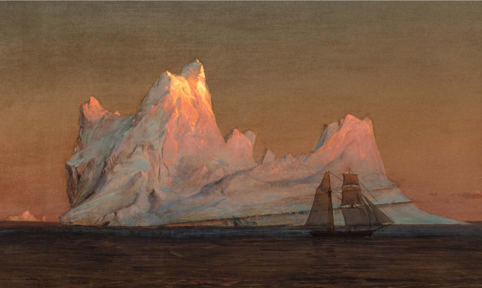
Frederic Edwin Church, The Iceberg (detail), c. 1875, oil on canvas, 22 x 27 in. (55.9 x 68.6 cm), Terra Foundation for American Art, Daniel J. Terra Collection, 1993.6.