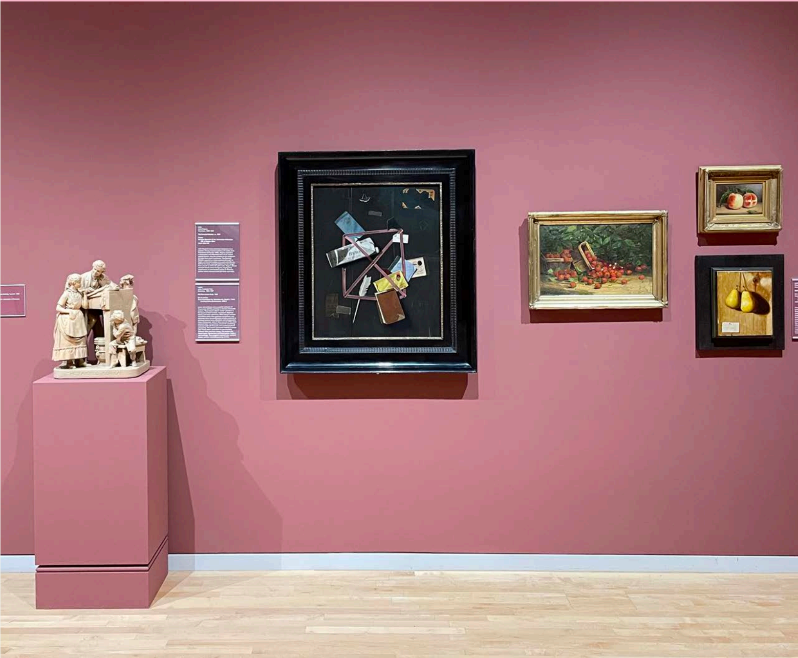
Facing: The Terra Foundation for American Art’s Old Time Letter Rack by John F. Peto at the Georgia Museum of Art, University of Georgia.