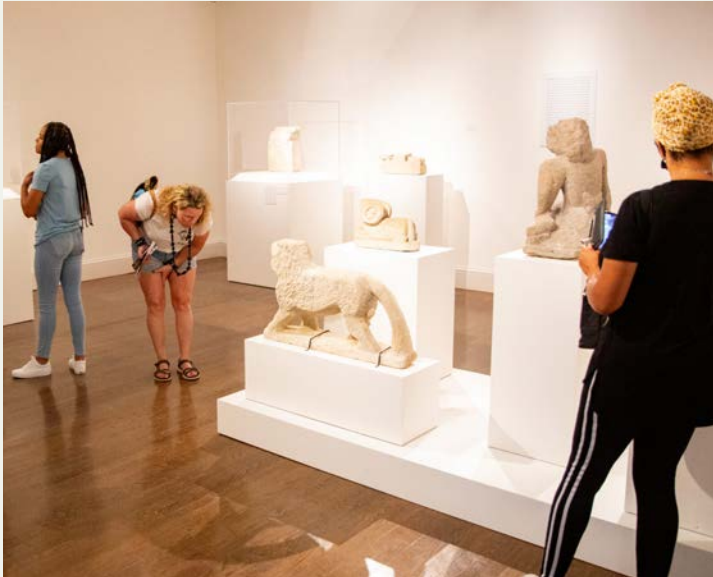
All: Visitors to The Sculpture of William Edmondson: Tombstones, Garden Ornaments, and Stonework, 2021, Cheekwood Estate & Gardens.