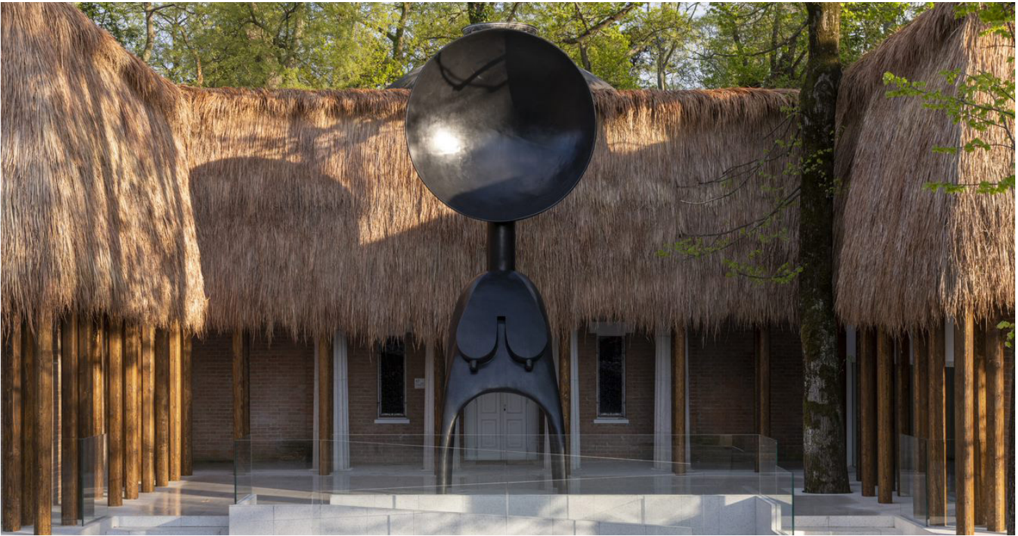
Simone Leigh: Façade , 2022. Thatch, steel, and wood, dimensions variable. Satellite , 2022. Bronze, 24 feet × 10 feet × 7 feet 7 inches (7.3 × 3 × 2.3 m) (overall).

Exhibitions grants provide support for organizations within and outside the United States to plan and present temporary exhibitions comprised primarily of loans.