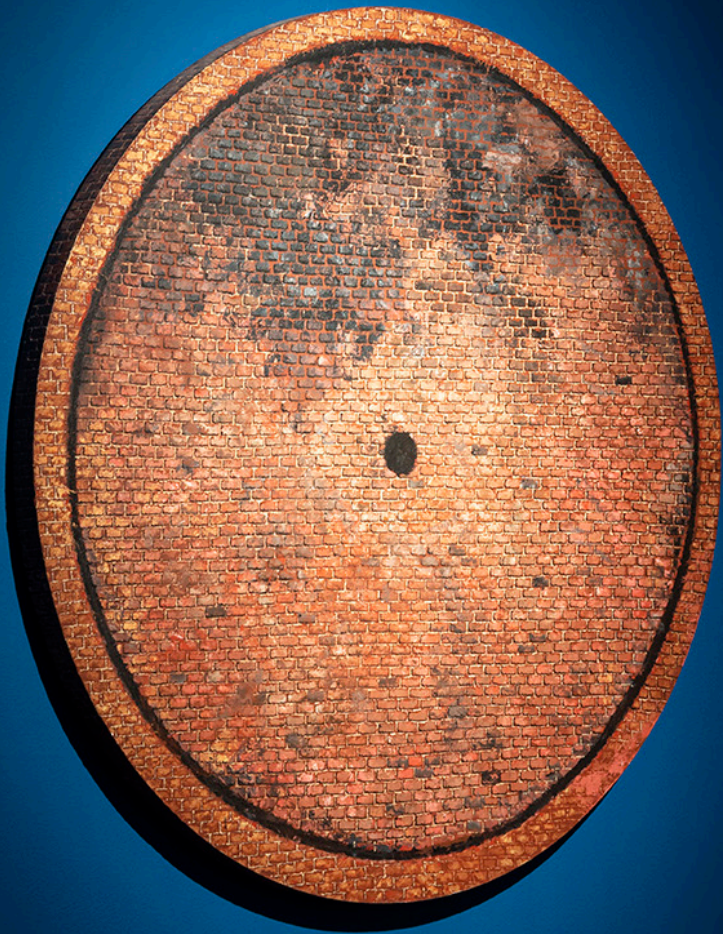
Facing: Martin Wong. Malicious Mischief, 2022. Installation view of exhibition at Museo CA2M, Madrid 2022.