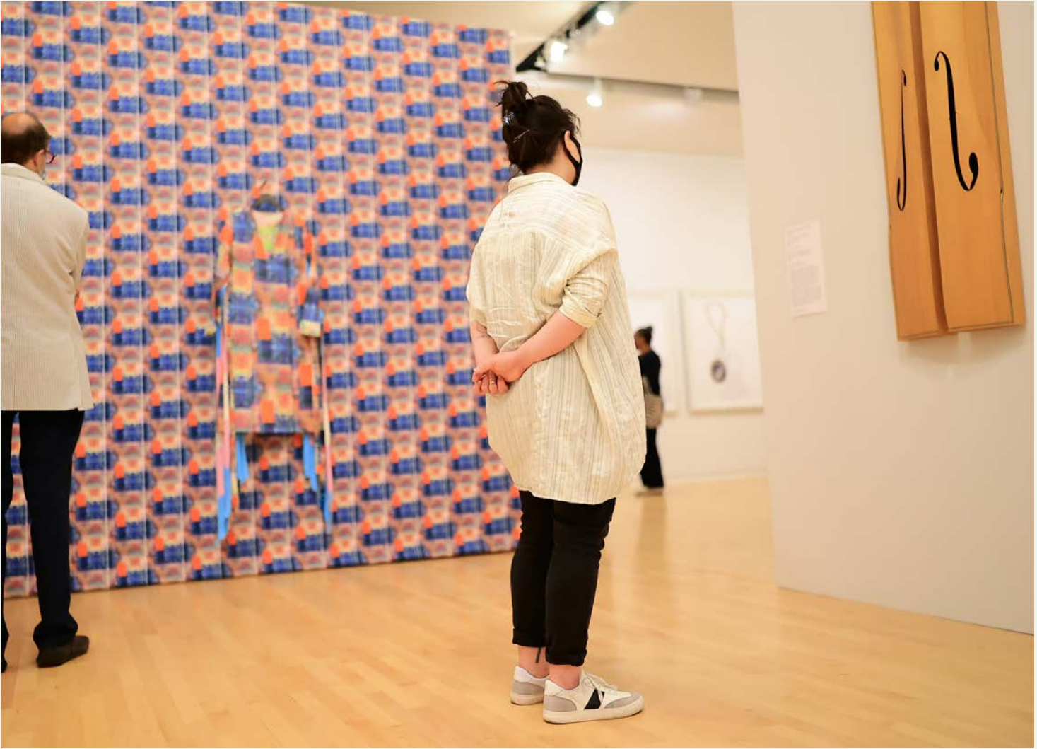
A Site of Struggle: American Art against Anti-Black Violence , Block Museum of Art, Northwestern University, 2022.

JANET DEES, STEVEN AND LISA MUNSTER TANANBAUM CURATOR OF MODERN AND CONTEMPORARY ART, BLOCK MUSEUM OF ART