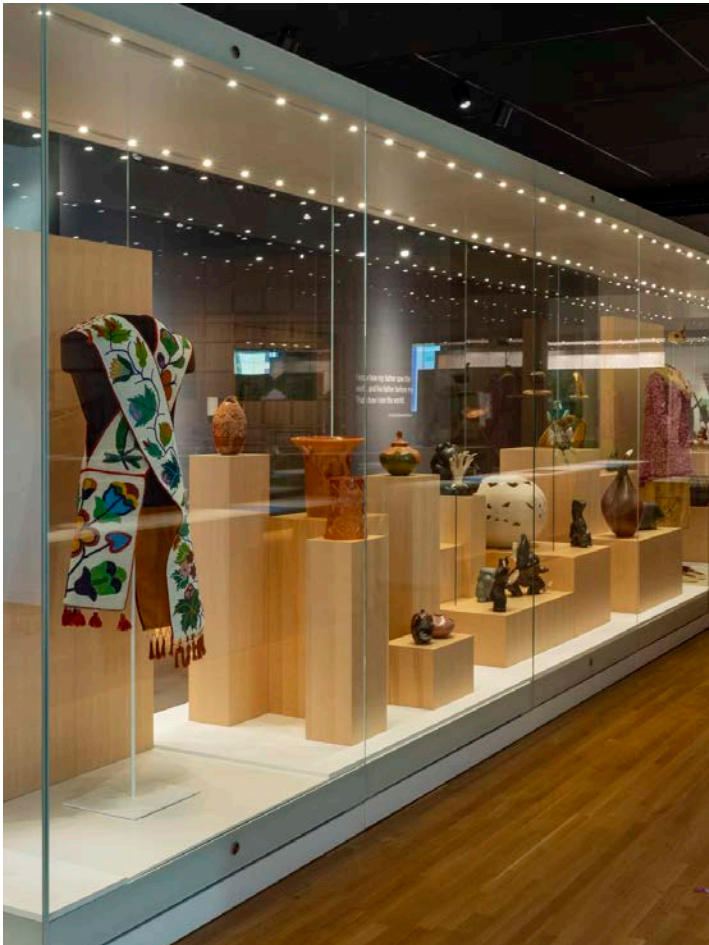
Left and Facing: The Eiteljorg Museum’s new Native American Galleries, featuring Expressions of Life: Native Art in North America, showcasing Native art, told through the voices of Native Americans in a multi-sensory, state-of-the-art space.

To support Mickalene Thomas/Against the Sharp White Background at the Yale University Art Gallery. The exhibition positions Mickalene Thomas in the dual role of artist and curator. The exhibition is the first of its kind, blending Thomas’s work with pre-Civil War-era portraits of African American sitters. An English-language catalogue accompanies the exhibition.