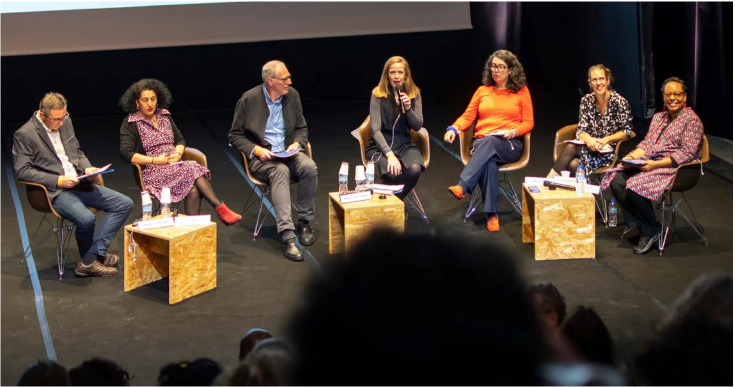
Musées partagés octobre 2022.

Strategic Initiatives provide investment in organizations’ capacity building or support for programming efforts to address inequities in current and historical presentations and understandings of American art history. These grants often support programs or test new ideas that challenge the status quo and help reimagine the narratives, practices, and presentations of American art.