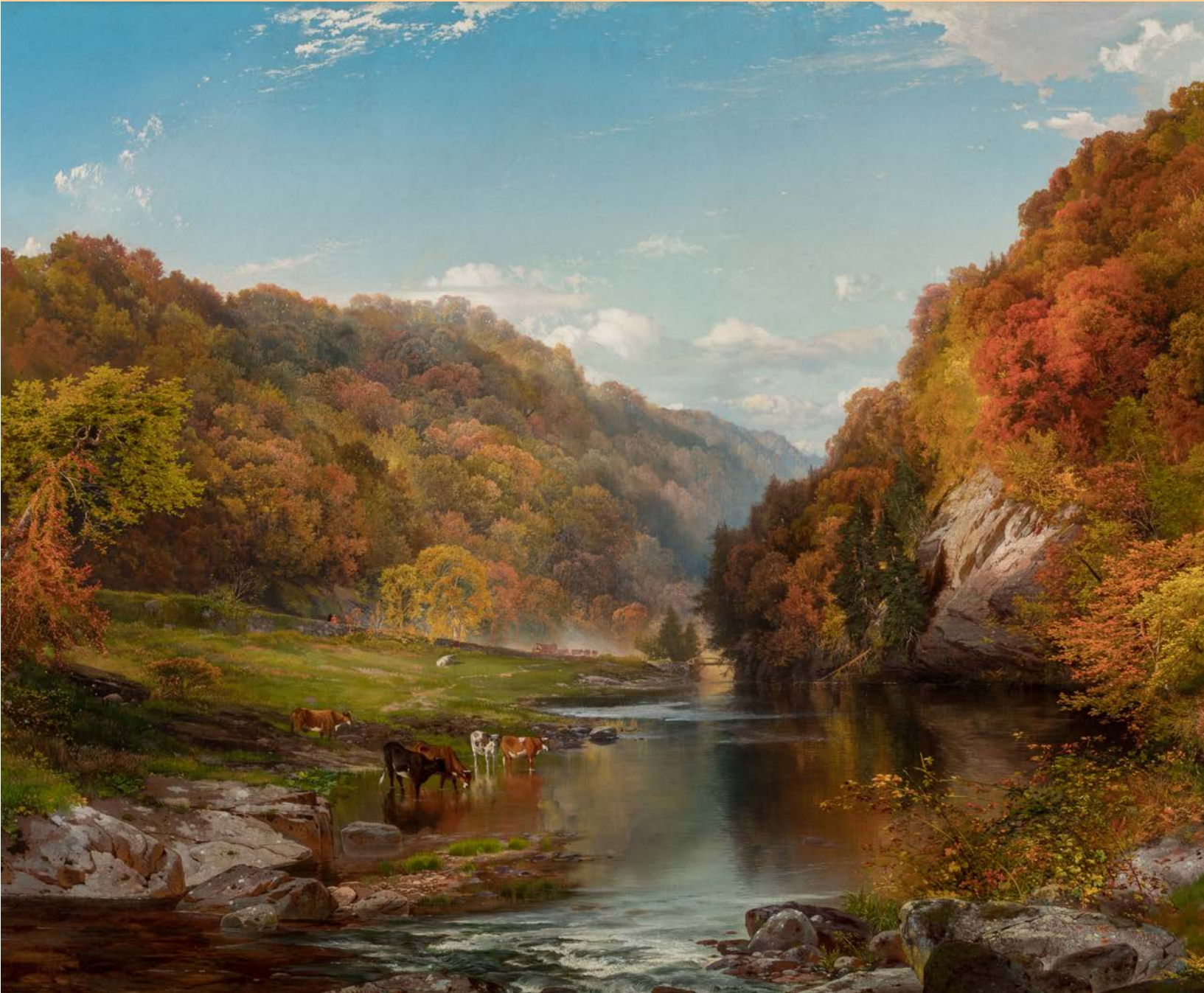
Facing: Thomas Moran, Autumn Afternoon, the Wissahickon (detail), 1864, oil on canvas, 30 1/4 x 45 1/4 in. (76.8 x 114.9 cm), Terra Foundation for American Art, Daniel J. Terra Collection, 1999.99