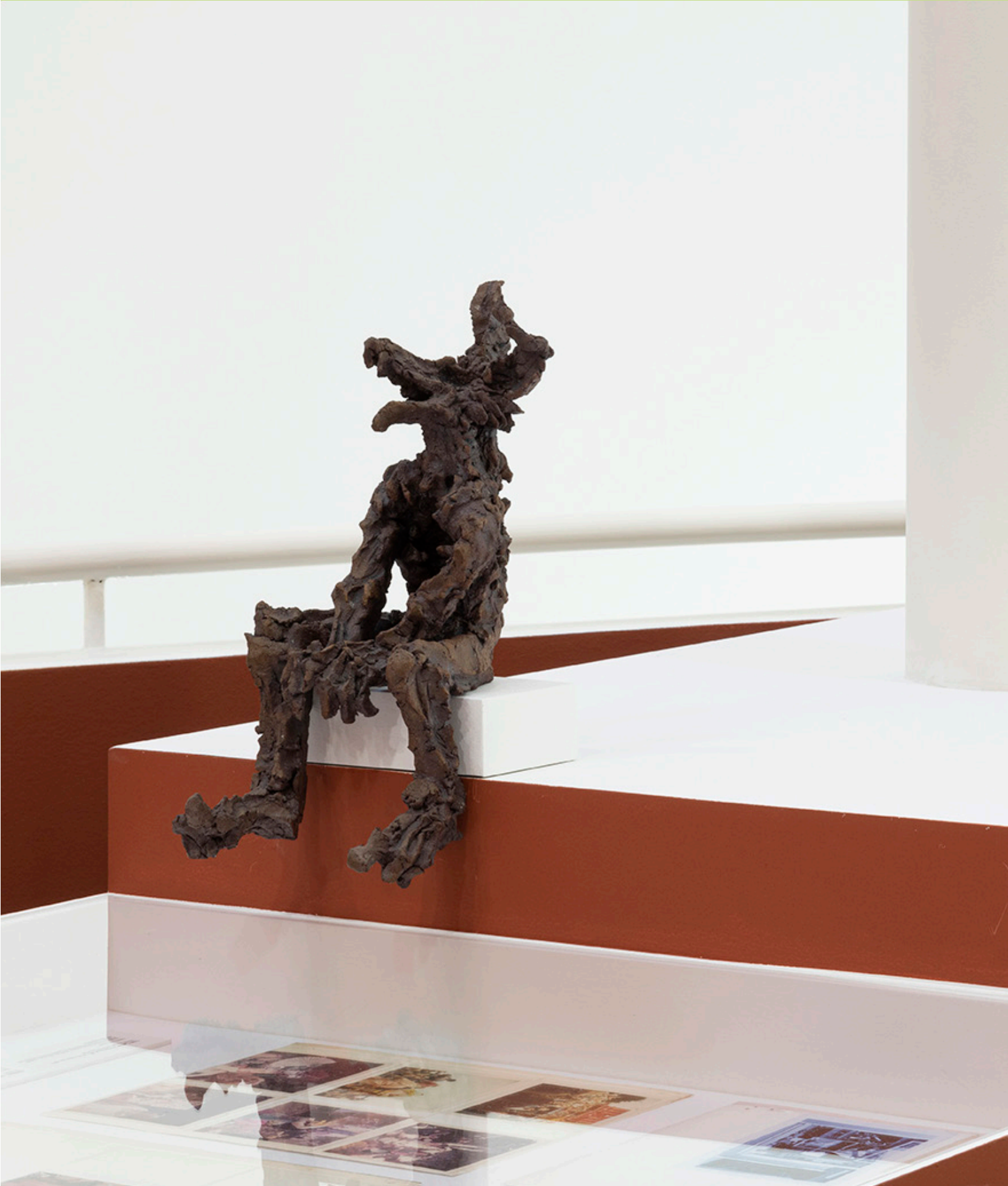
Facing: Martin Wong. Malicious Mischief, 2022. Installation view of exhibition at Museo CA2M, Madrid 2022.

To support research and development activities for an exhibition with the working title Land, water, garden—urbs in horto—Greening the Swamp , which explores the art and design of Chicago’s green infrastructure as it has unfolded from its Indigenous roots to contemporary green designs and environmental initiatives. The grant supports a series of research convenings and public programs with scholars, environmental activists, practitioners of design, and members of the public, all of which yield input on exhibition plans. The project is expected to lead to an exhibition as part of the Terra Foundation initiative Art Design Chicago.