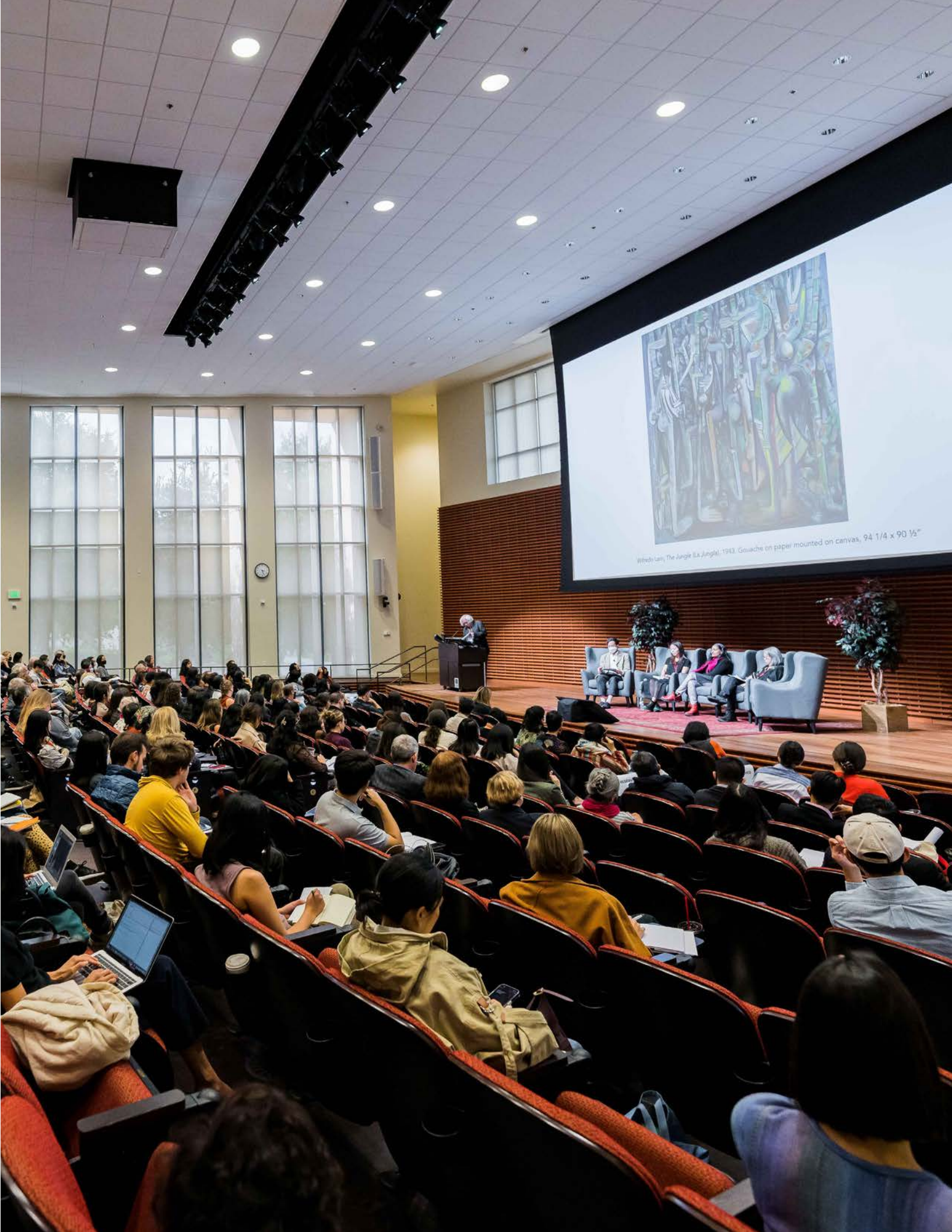
Next Page: Martin Wong. Malicious Mischief , 2022. Installation view of exhibition at Museo CA2M, Madrid 2022.