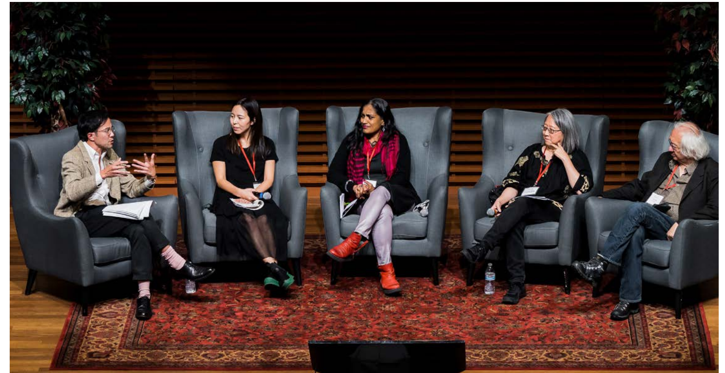
Stanford University, Cantor Arts Center, Asian American Art Initiative, October 28–29, 2022, symposium “IMU UR2: Art, Aesthetics, and Asian America Art,”

This two-day convening at Stanford University brought together artists, curators, and scholars to reimagine the histories and futures of artists of Asian descent through a convening that emphasized dialogue, experimentation, and deep engagement with images.