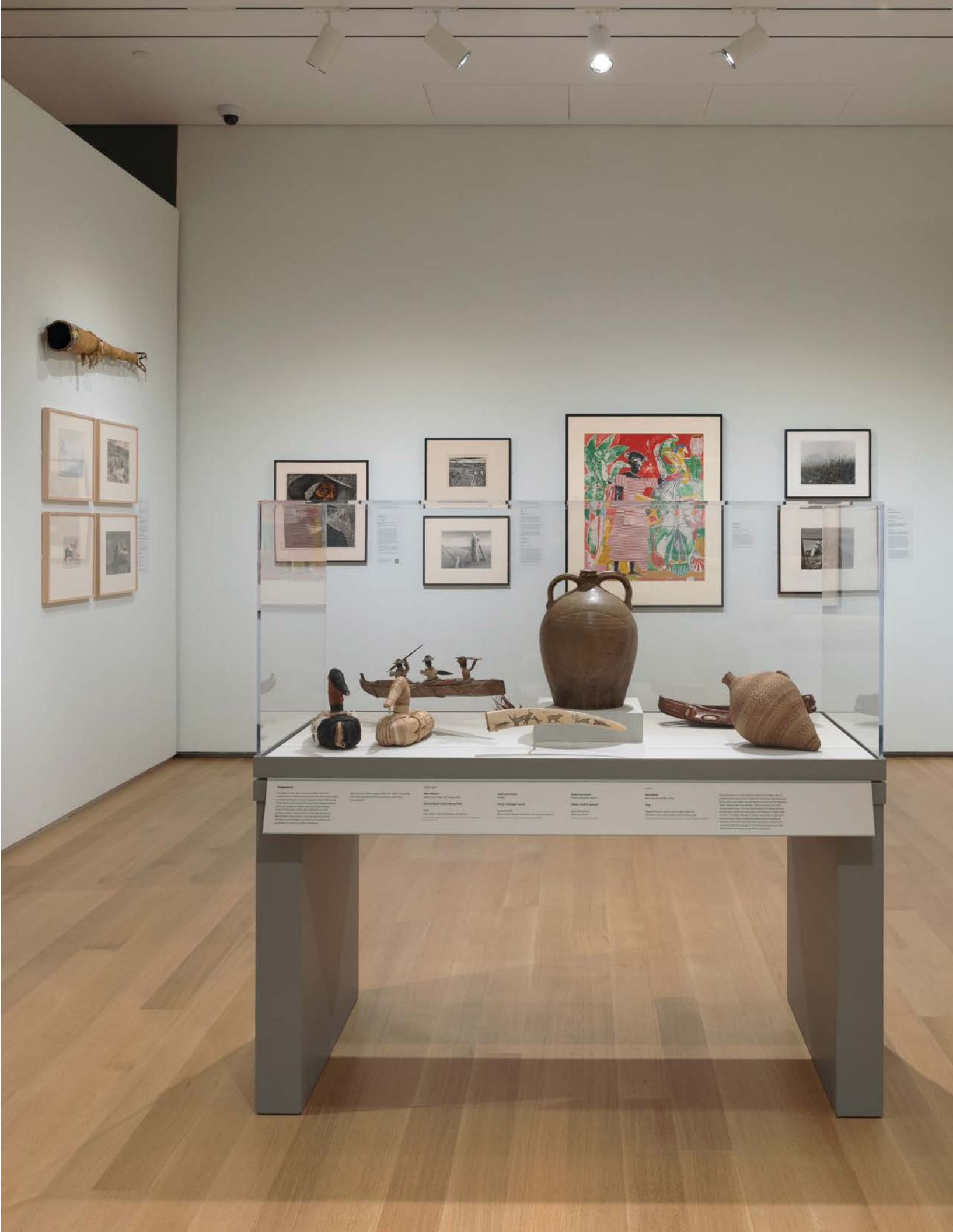
Facing: This Land: American Engagement with the Natural World installed at the Hood Museum of Art, January 5–July 23, 2022.

To support the renewal of the annual Terra Foundation for American Art Visiting Professorship at the University of Oxford for three years, starting fall 2018 and ending in spring 2021. The Professor teaches courses at the master’s and undergraduate levels, supervises master’s students, and gives a series of public lectures on campus and elsewhere.