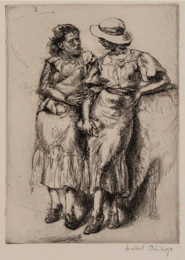
Isabel Bishop, Noon Hour , 1935, etching on off-white wove paper, 6 3/4 x 4 15/16 in. (17.1 x 12.5 cm), Terra Foundation for American Art, Daniel J. Terra Collection, 1996.84.

To support Cross Pollination: Heade, Cole, Church, and Our Contemporary Moment , an exhibition co-organized by the Olana State Historic Site, the Thomas Cole National Historic Site, and Crystal Bridges. Examining the complex relationships between art, nature, and science through the lens of three nineteenth-century artists, the exhibition highlights the metaphorical pollination of ideas among artists and between artists and scientists, in the nineteenth century and today. The exhibition travels to the co-organizing venues, as well as to the Cummer Museum and Gardens and Reynolda House Museum of American Art, and it is accompanied by an English-language catalogue.