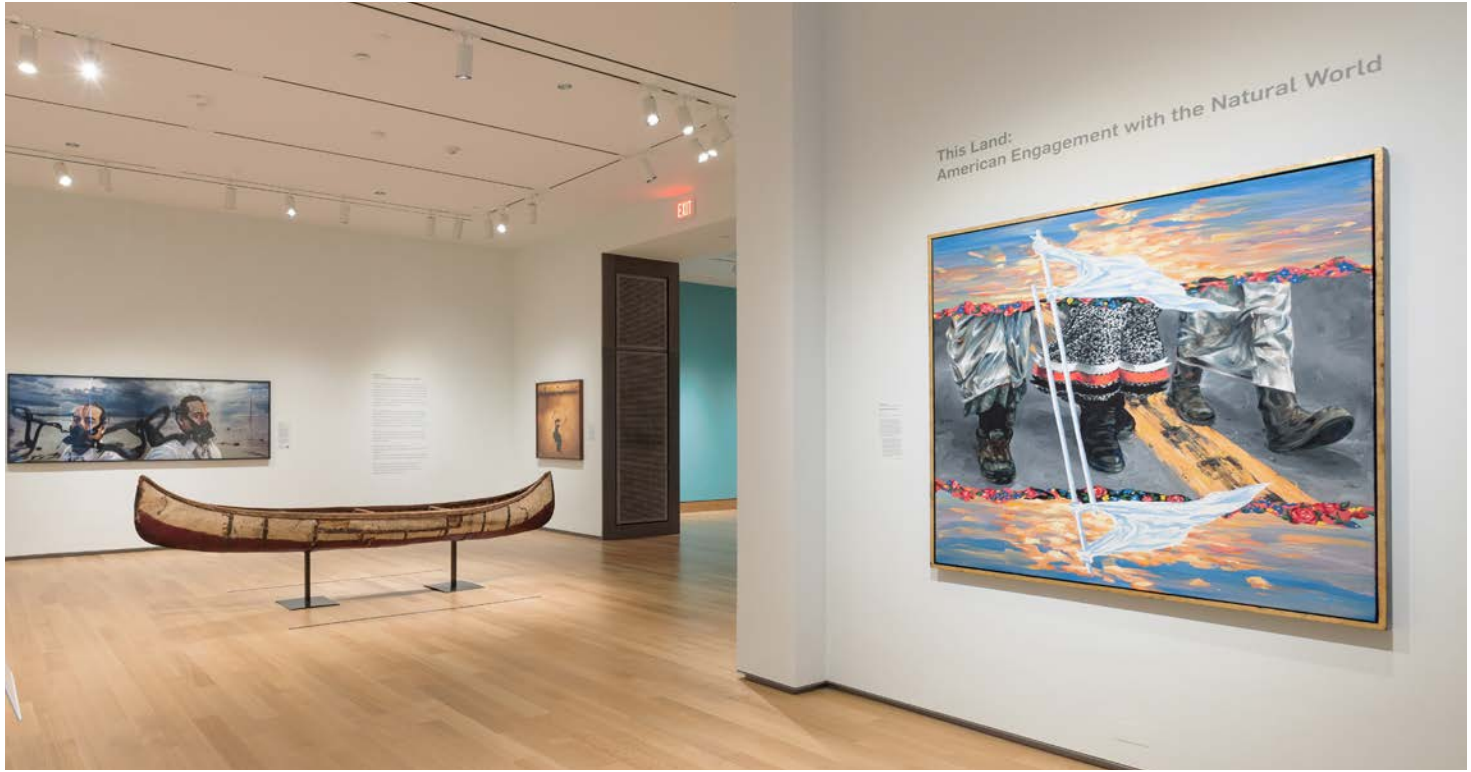
This Land: American Engagement with the Natural World installed at the Hood Museum of Art, January 5–July 23, 2022.

The Hood Museum of Art’s first major thematic installation of its American art collection featured Euro-American, African American, Latin American, and Asian American artists, and—for the first time—traditional and contemporary Native American art alongside early-to-contemporary non-Native American art. Accompanied by public programs, an academic conference, and a scholarly publication, the exhibition surveyed artistic responses to the natural world, contending with themes such as climate change, food acquisition and security, and individual and community relationships with the environment.