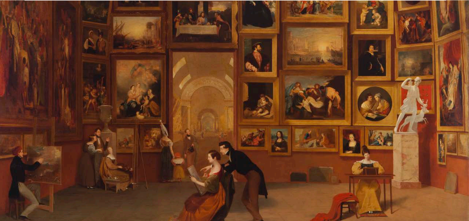
Samuel F. B. Morse, Gallery of the Louvre (detail), 1831–33, oil on canvas, 73 3/4 x 108 in. (187.3 x 274.3 cm), Terra Foundation for American Art, Daniel J. Terra Collection, 1992.51