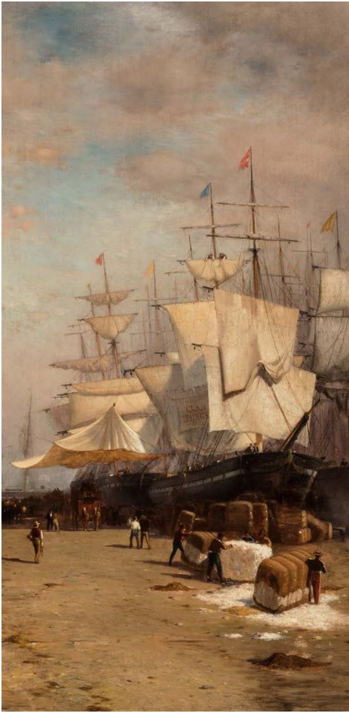
Samuel Colman, Jr., Ships Unloading (detail), New York , 1868, oil on canvas mounted on board, 41 5/16 x 29 15/16 in. (105.0 x 76.0 cm), Terra Foundation for American Art, Daniel J. Terra Collection, 1984.4