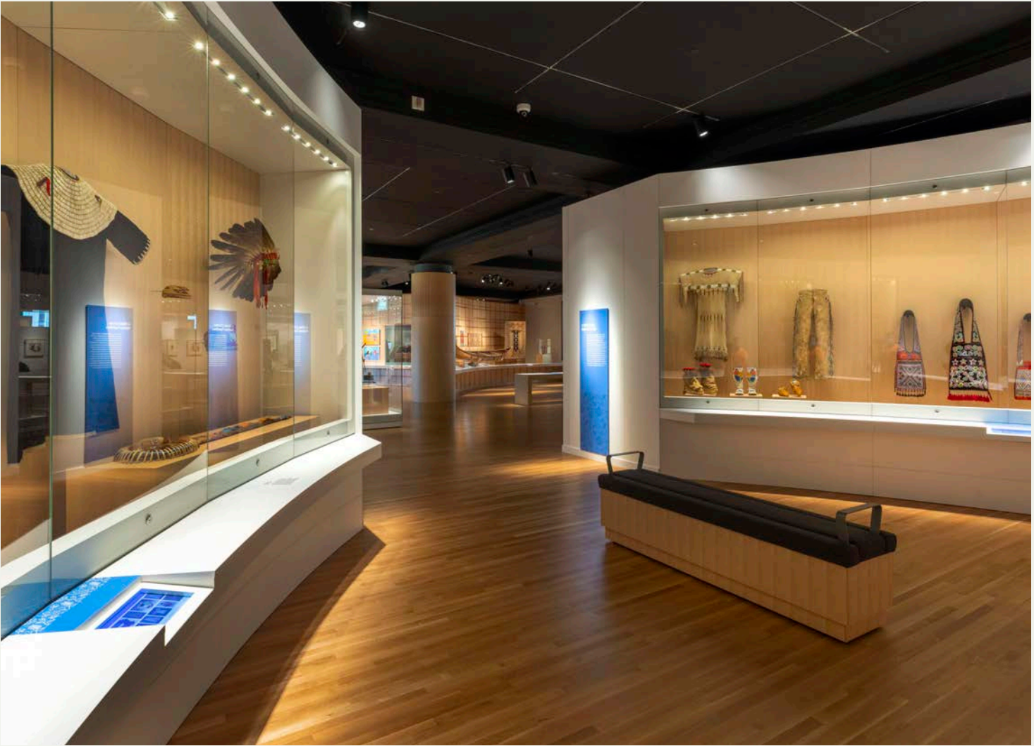
The Eiteljorg Museum’s new Native American Galleries, featuring Expressions of Life: Native Art in North America, showcasing Native art, told through the voices of Native Americans in a multi-sensory, state-of-the-art space.