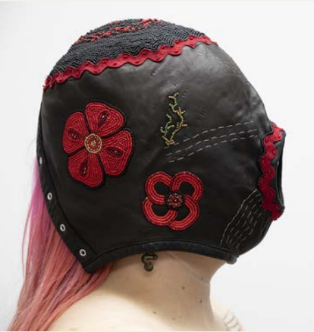
Facing: River Garza, Untitled (Cowboy) , 2020, photo courtesy of the artist and Soul of Nations.