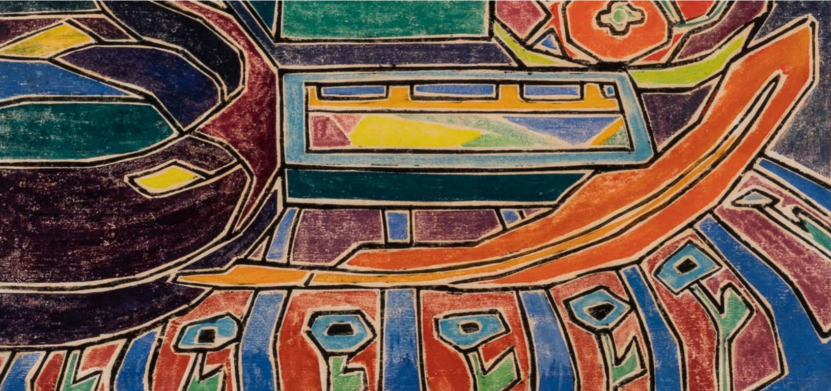
Blanche Lazzell, Still Life (detail), 1919 (block cut), 1931 (printed), color woodcut on Japanese paper, block: 11 1/2 x 11 7/8 in. (29.2 x 30.2 cm), Terra Foundation for American Art, Daniel J. Terra Collection, 1996.32