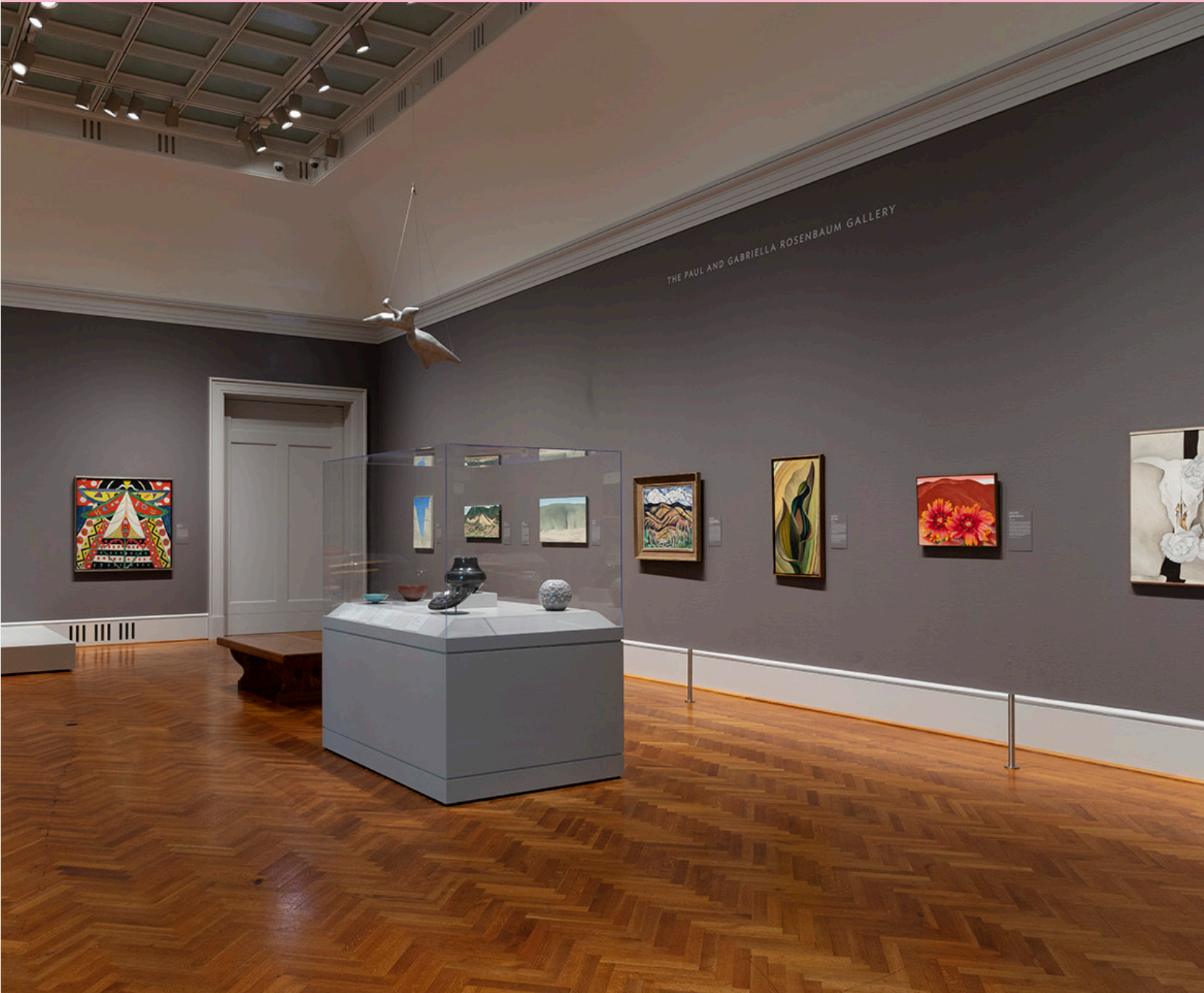
Facing: Arts of the Americas collection installed in Gallery 265, The Paul and Gabriella Rosenbaum Gallery, The Art Institute of Chicago.