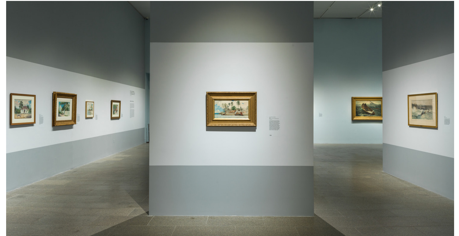
Winslow Homer: Crosscurrents , April 11–July 31, 2022, The Metropolitan Museum of Art.

The Terra Foundation uses its art collection to foster intercultural dialogue and expand narratives of American art. The foundation makes its collection—more than 750 paintings, prints, drawings, photographs, and sculptures by 242 artists working between the 1750s and the 1980s—available throughout the world through loans and exhibition projects. Through the Terra Collection-in-Residence initiative, artworks are loaned for extended periods to invited university and research museums within and outside the United States.