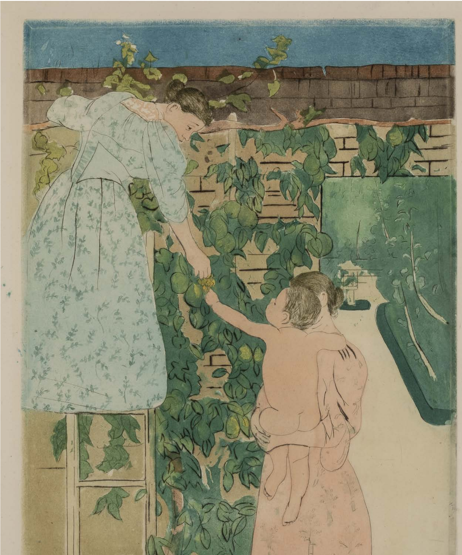
Facing: Mary Cassatt, Gathering Fruit , c. 1893, drypoint, softground etching and aquatint in color on ivory laid paper, 16 5/8 x 11 5/8 in. (42.2 x 29.5 cm), Terra Foundation for American Art, Daniel J. Terra Collection, 1993.14

To support a reinstallation of Worcester Art Museum’s American art collection titled Conspicuous Consumption: The Price of Luxury in American Art (1675–1870) .